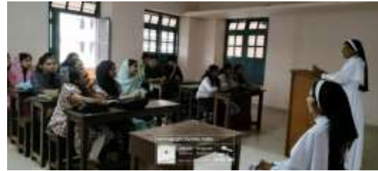
Special Training for Academically Backward Students