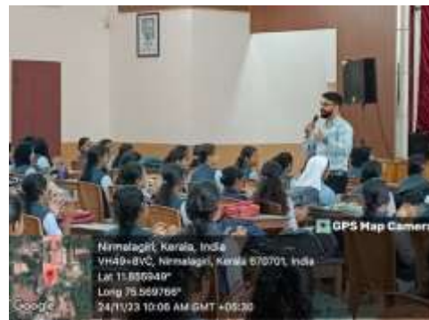
Special training Programme