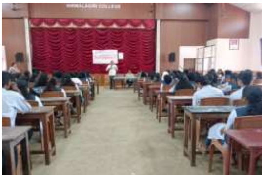
Orientation Programme for Students