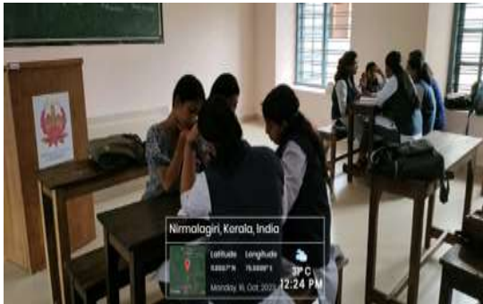
Special Training for Academically Backward Students-Discussion & Learning