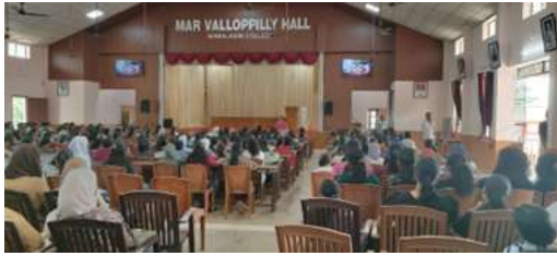
Induction Programme for students